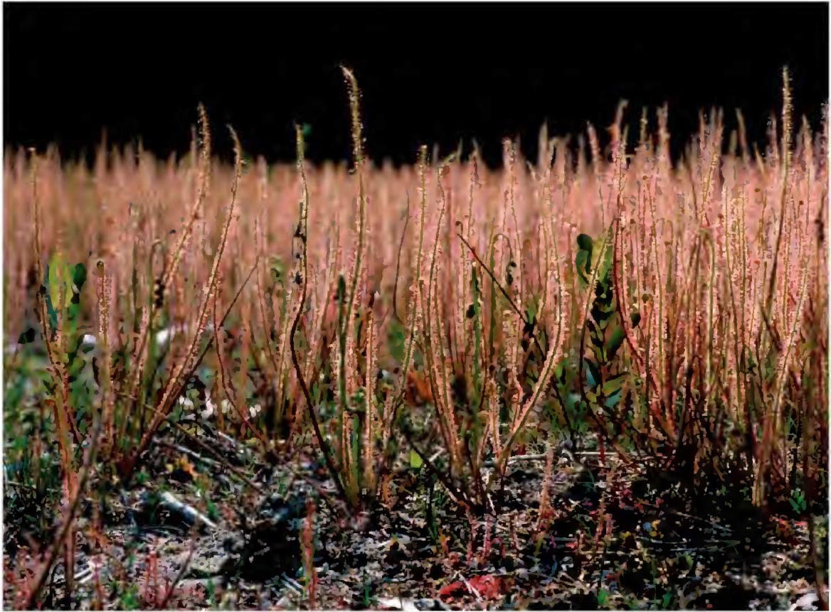
Figure 3: Drosera filiformis growing on sandy flats in New Jersey (Ocean County).